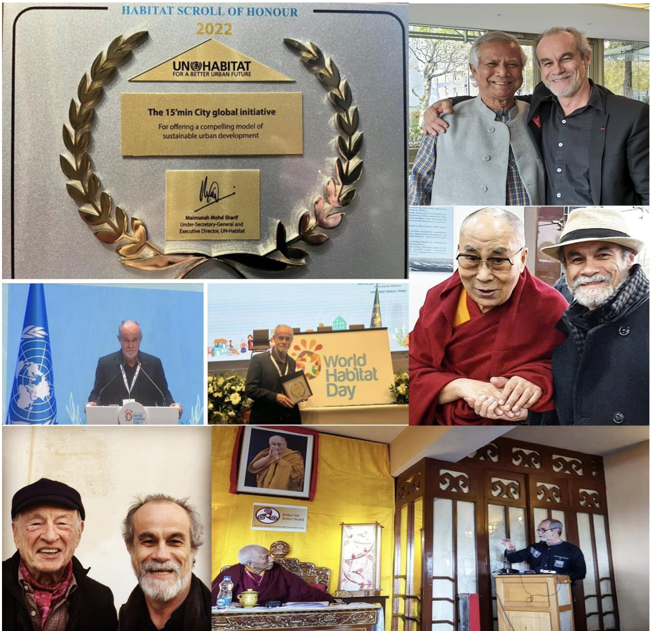
UN-HABITAT Scroll of Honour - 2022 Dalai Lama Prix Nobel 1989 Muhamad Yunus Prix Nobel 2006 Samdong Rinpoche – Conseiller scientifique du Dalai Lama Edgar Morin